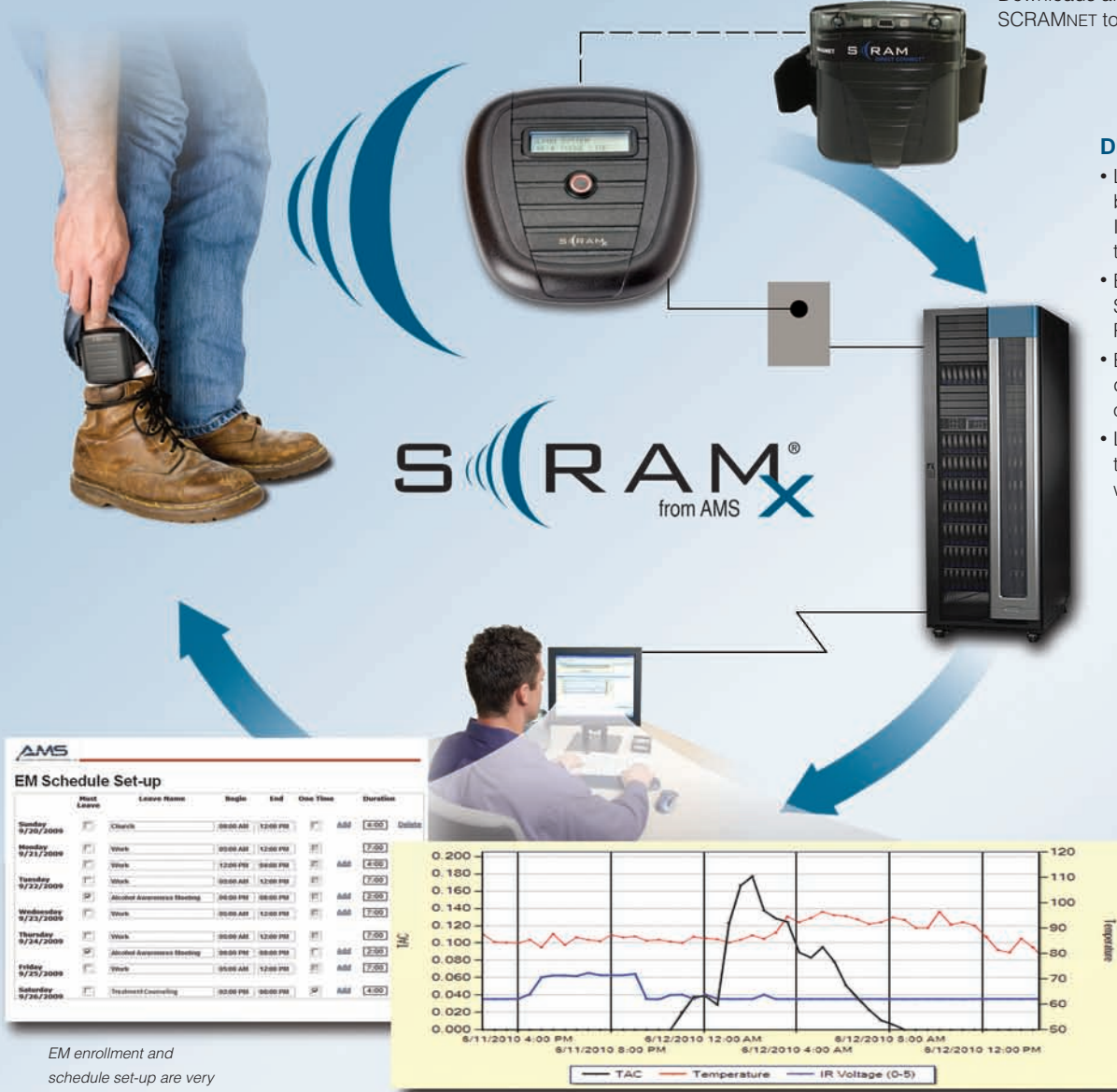
This graph depicts an attempted tamper (blue line), followed by a drinking event (black line) showing a gradual increase in alcohol, then slowly burning off

EM enrollment and schedule set-up are very simple, and don't require dual data entry as with two separate devices